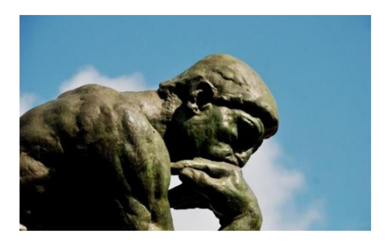
Think Tank of the Year 2017 – Top Think Tank in the World Table 1

With that, it gives me great satisfaction and pleasure to present the results of the 2017 rankings process below.